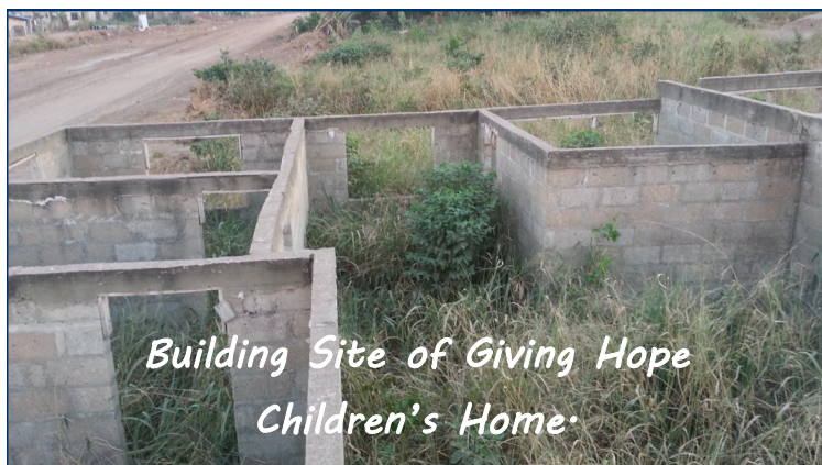
Building Site of Giving Hope Children's Home