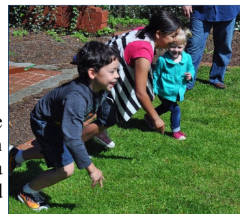
Our kids enjoying a race with their cousin Niece.

It has been a very busy summer for our family. Daughter and Son went on a big adventure of their own! My mom came to visit us for a week in May. She took the kids home with her. All by themselves they spent three weeks in Portland, enjoying time with their Nana and Papa and the rest of our family and friends. Then, my dad brought them back to us and spent a week with us here in South Carolina.